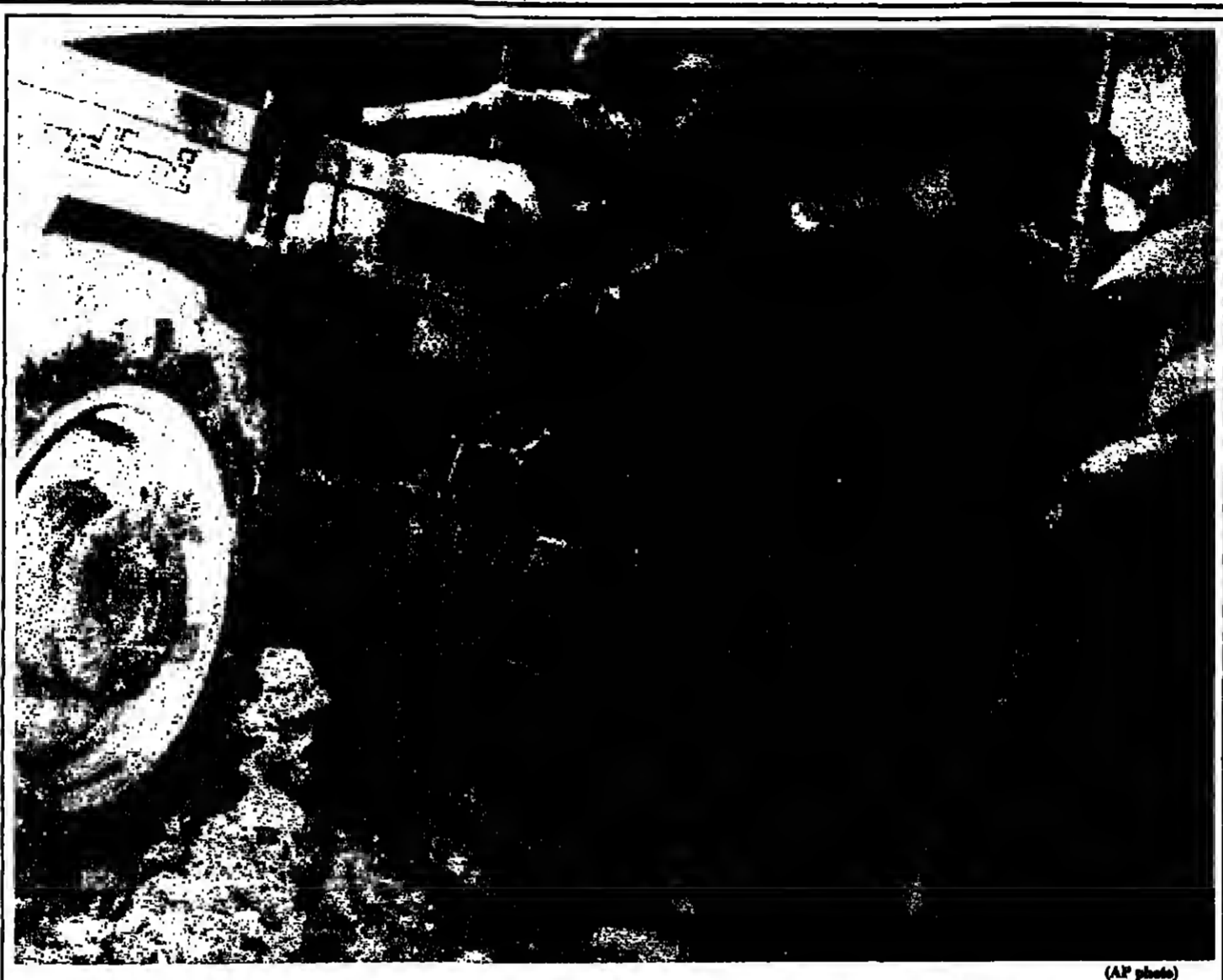
MAFIA SETTLEMENT OF ACCOUNT: The body of one of four farm workers shot dead recently near Agrigento, Sicily, is lying under the tractor in which the four were traveling when they were attacked. Police believe it was a mafia settlement of account.

governing Social Democratic Party (SPD) made clear last week that it did not favor any loosening of the export restrictions, although the chancellor has said he does not necessarily feel bound by party decisions. Some SPD leaders have hinted it might be possible, while retaining the general principle of no arms sales to tension zones, to except countries whose security is vital to West German or European interests. The Federal Security Council will be convened in late March after Foreign Minister Hans-Dietrich Genscher returns from talks in Washington, government sources said. They said Bonn was also conferring with its European partners on a new definition of zones vital to European security with a view to coordinating arms sales policy. Asked in the interview if a West German refusal to sell arms to Saudi Arabia would be seen as an unfriendly act, Schmidt said: "No, quite certainly not. But relations between Riyadh and London or Riyadh and Paris could develop more positively than between Riyadh and Bonn." "... At present I have the impression that if Saudi Arabia needs more weapons from the West than previously, they are more likely to receive them from the U.S. or France than from West Germany."